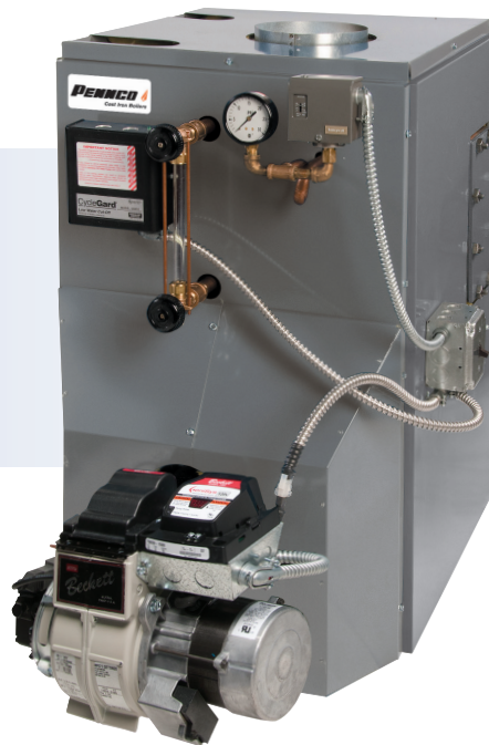
Heat Shield Baffle