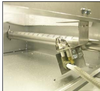
New Style Pilot

If you have any questions regarding the information contained in this letter, please contact our Technical Support Hotline at 1-800-325-5479.